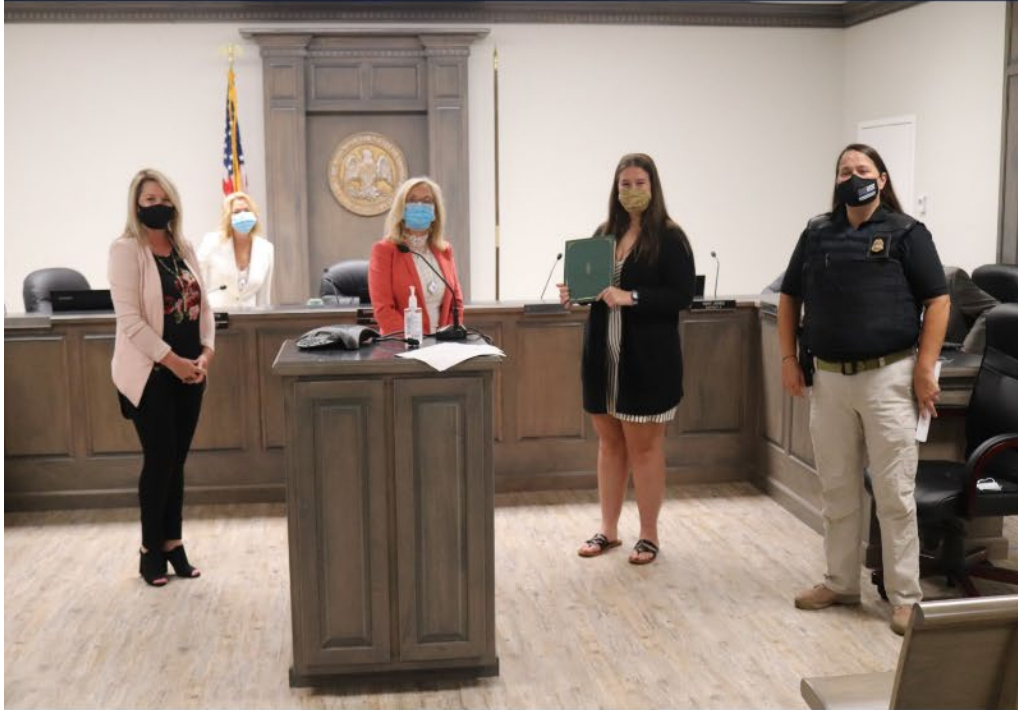
Harrison County Board of Supervisors presents scholarships